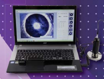
Optional Accessory: PHT-5000 Optical Brinell Scanner See Page 41